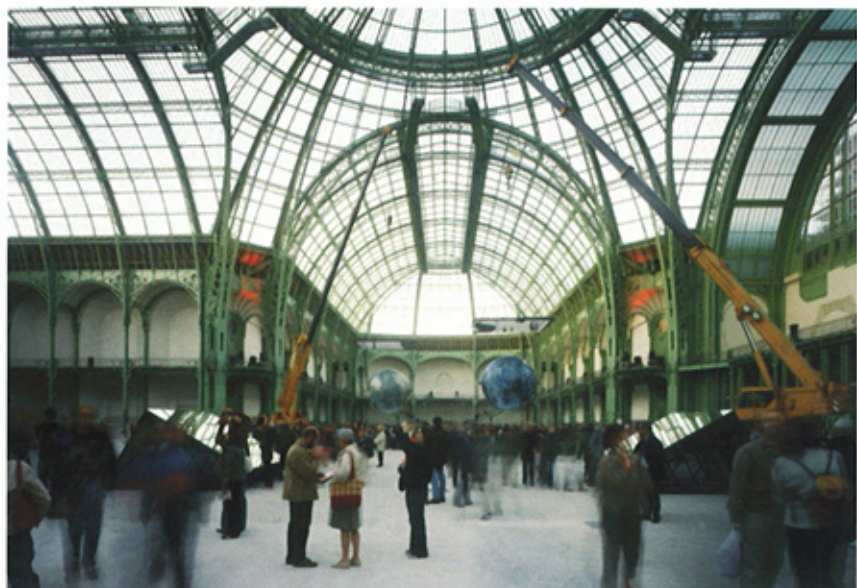
Dreyfus set out to create a feeling of 'serenity' for visitors in the vast glass and steel halls of the Grand Palais

"There was a wave of movement of light from the centre to the outside of the Grand Palais," he says, "then all became slowly red, beams reflecting in the mirrors, so when people were walking they had monochrome paintings around them,