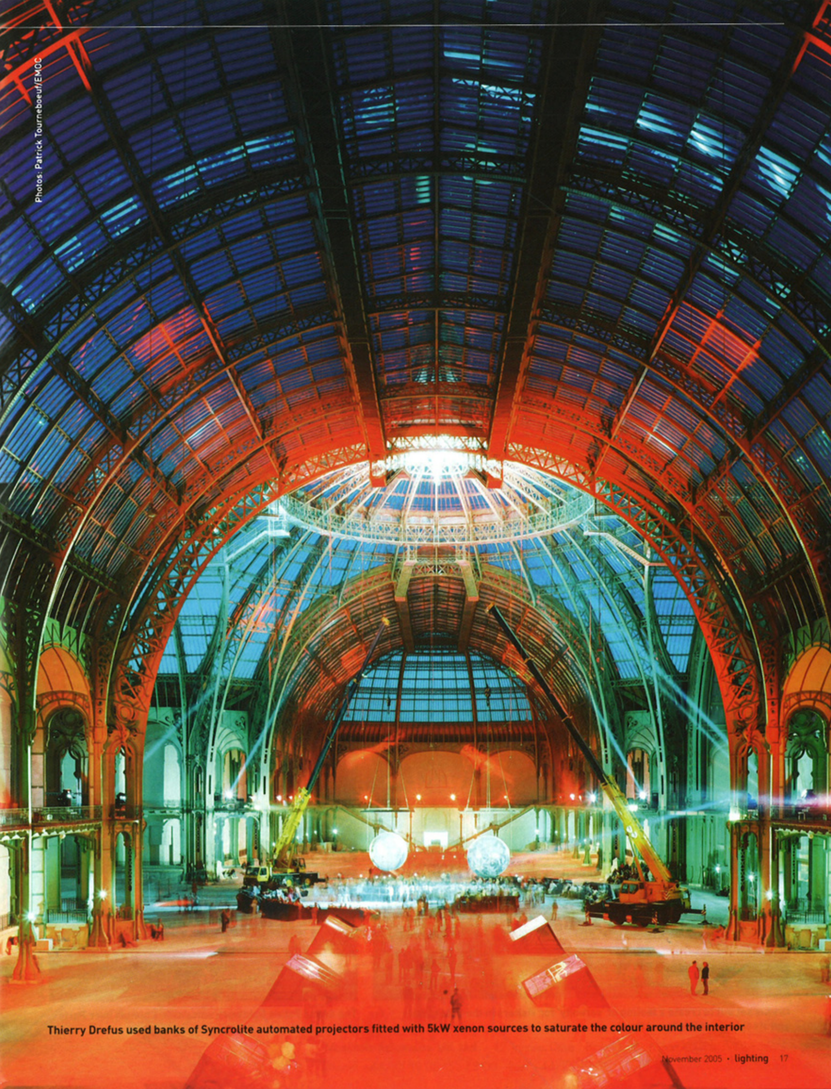
Thierry Drefus used banks of Synrolite automated projectors fitted with 5kW xenon sources to saturate the colour around the interior